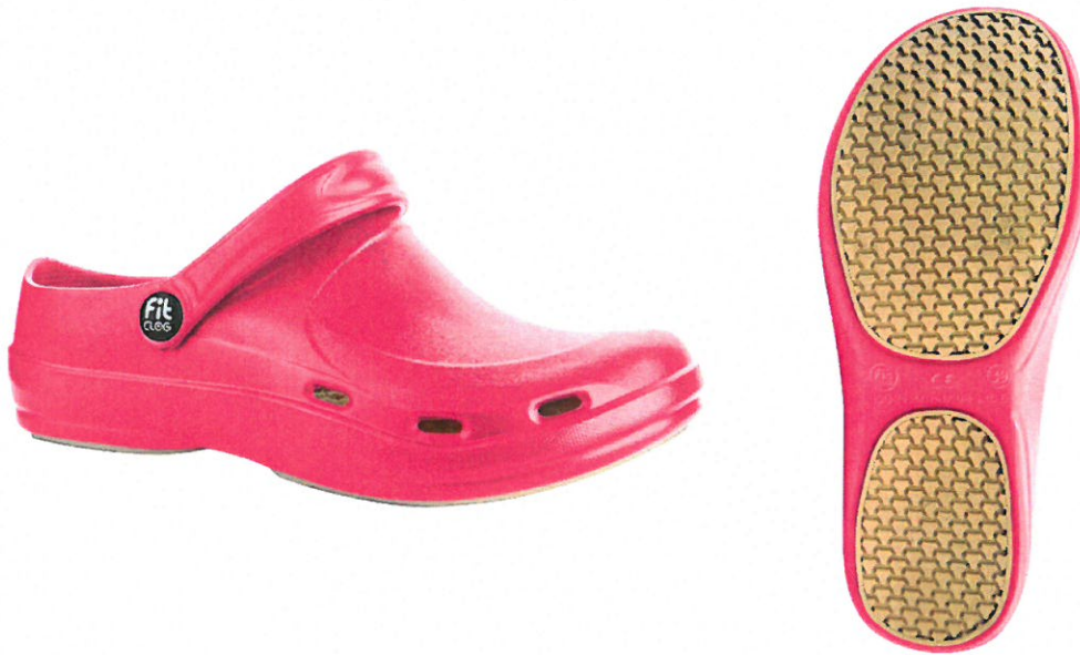
FitClog - BASIC